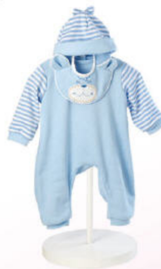
Cuddle Bear #920870 Size: 20"