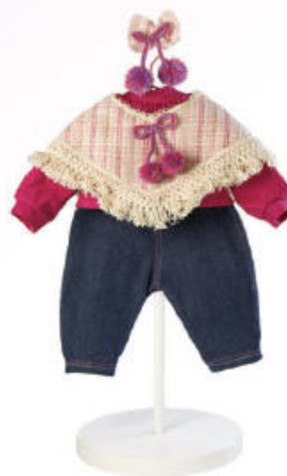
Poncho Posh #920779 Size: 20"