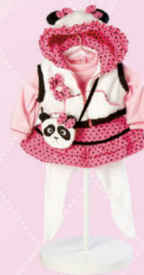
Panda Fun #920841 Size: 20"