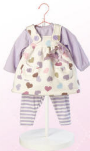
I Love You #920843 Size: 20"