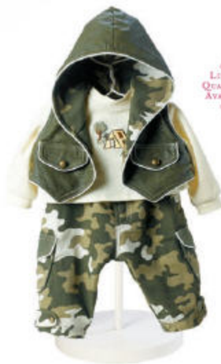
Camp Fun #20920777 Size: 20"