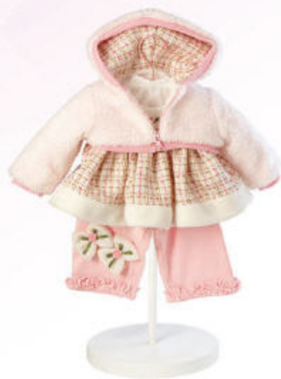
Best Friend #920857 Size: 20"