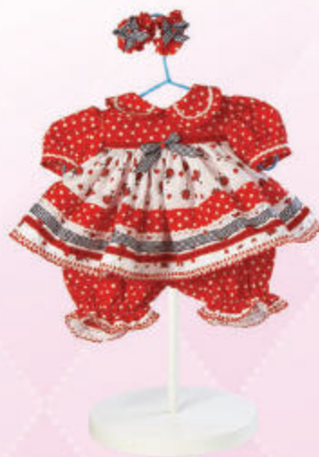
Ladybug! Ladybug! #920824 Size: 20"