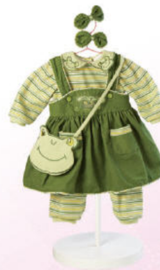
Froggy Fun - Girl #920294 Size: 20"