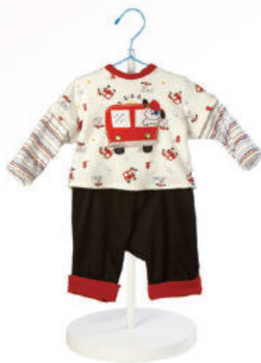
Ready To Go #920840 Size: 20"