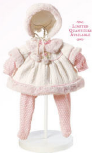
Bundle of Sweetness #20920775 Size: 20"