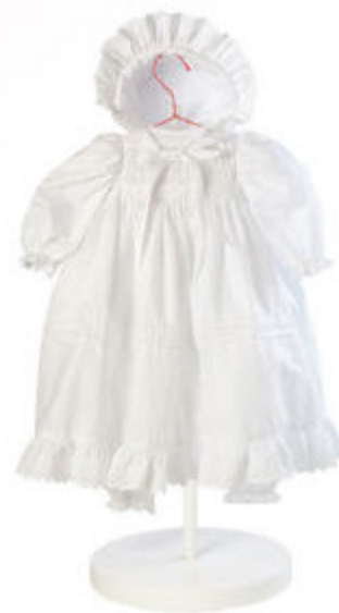
Blessings #920861 Size: 20"