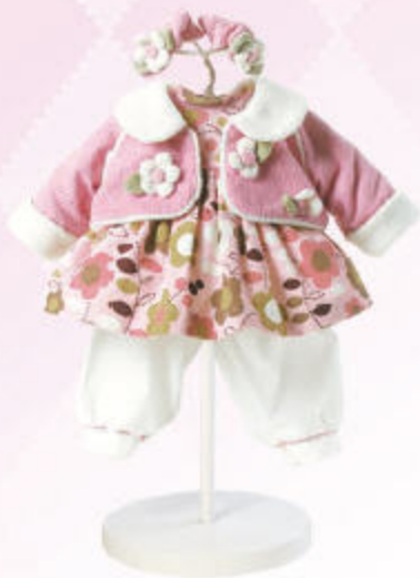
Best Dressed #20920772 Size: 20"