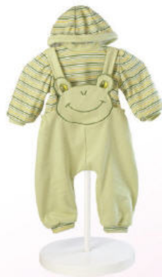
Froggy Fun - Boy #920293 Size: 20"