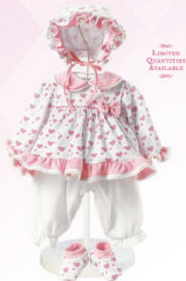
Pink Hearts For Baby #20920755 Size: 20"