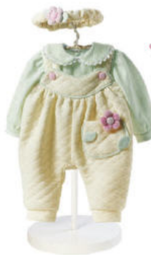
Romper Room #20920785 Size: 20"