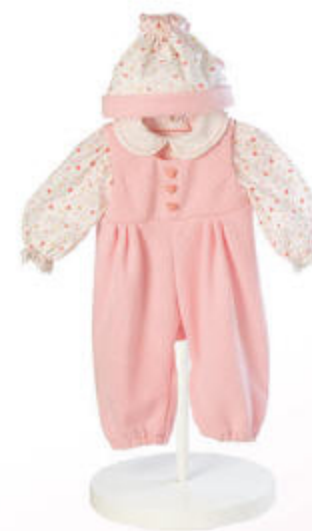
Sweetheart #920865 Size: 20"