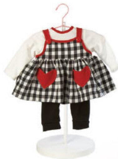
Check Mate #920827 Size: 20"